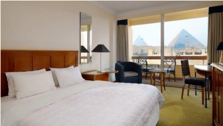
Figure 2 Le Meridian Al Haram Cairo Pyramids Hotel