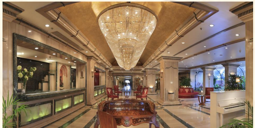
Figure 3 Sonesta St. George Luxor Hotel