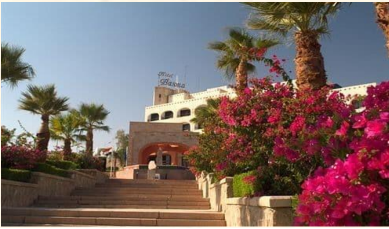
Figure 1 Basma Hotel Aswan